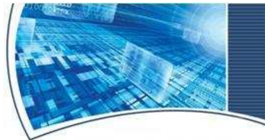
Monetary Financing of PDVSA